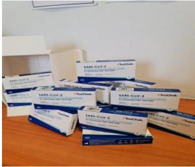
OZDENT PTY LTD RAPID ANTIGEN TEST